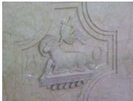
Revelation Lamb under Tabernacle St. Benedict's Church