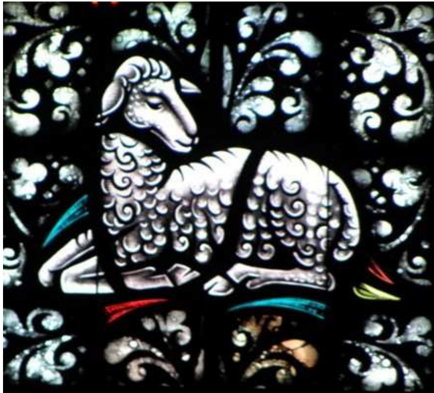
Lamb under transept window of Mary St. Benedict's Church