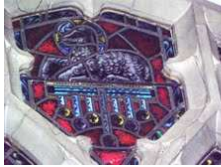
Revelation Lamb in Gothic choir window St. Benedict's Church